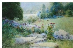
Springtime in Kentucky